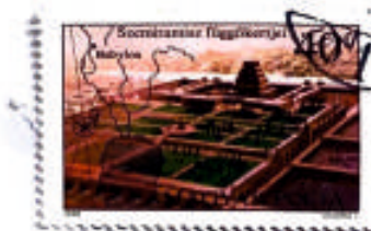
Ruins of Babylon

The Babylonian Astronomy refers to the theories and methods developed in Mesopotamia by Priest and Rituals followed by them