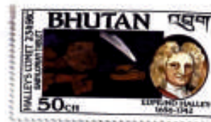
Babylonian tablet with inscription of appearance of comet